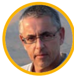
Dr Norman Swan