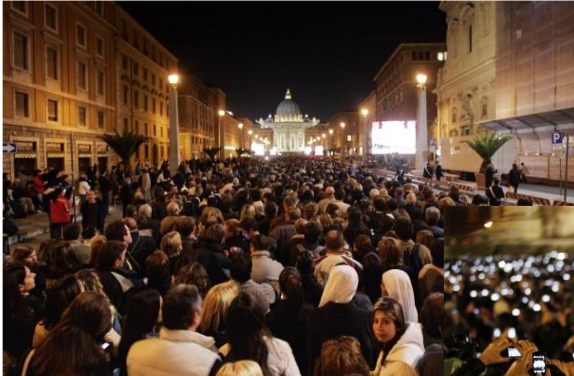
Funeral, Pope John Paul II, April 2005