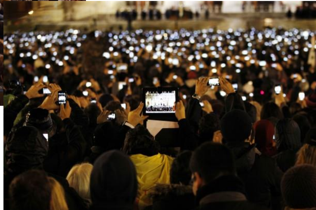
Announcement of Pope Francis' election, March 2013