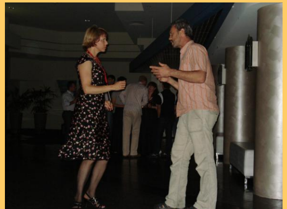
Uma Thurman and John Travolta lead the way on the dance floor