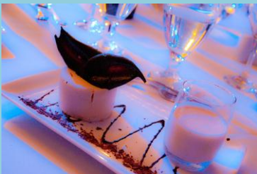
Dessert - I miss it so...