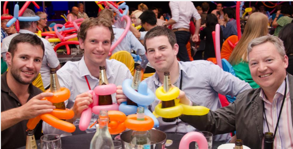
You can book these creative types for your child's next birthday party