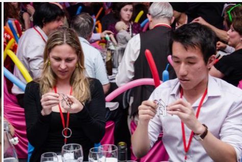
A riddle, inside an enigma ...