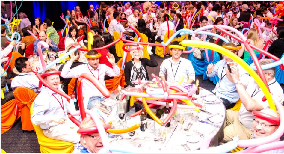
There has never been so much latex at an Actuaries Institute seminar