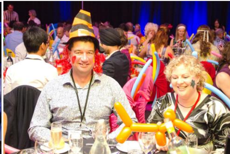
Sit Ubu, sit. Good dog.