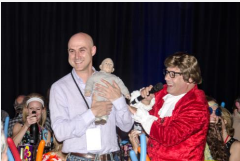
"Why must I be surrounded by freakin' idiots?!"