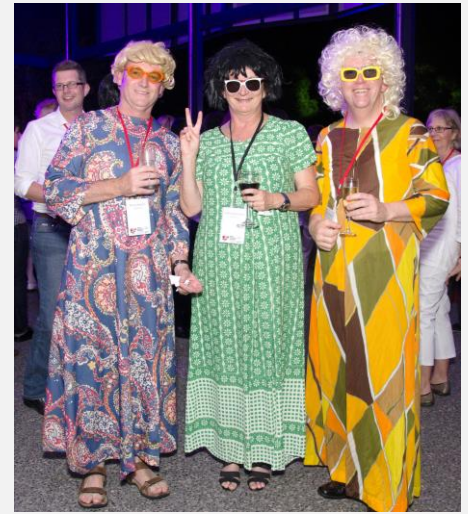
Peace, love and cross-dressing at Comcare