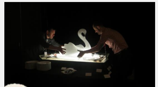
... before the great swan heist