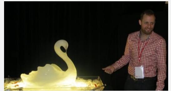
The moment of inspiration...